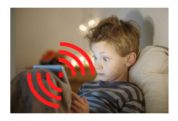
What's wrong with this picture?

Vision issues aside, this light acts to significantly attenuate melatonin production in the brain. The first order effect here is interference with the circadian rhythm and sleep disturbance. The research literature on the effect that screens have in suppressing melatonin is levels unequivocal. Cajochen et al. provide convincing evidence of the effect that "A 5-h evening exposure to a white LED backlit screen... elicited a significant suppression of the evening rise in endogenous melatonin and subjective as well as objective sleepiness, as indexed by a reduced incidence of slow movements and EEG low-frequency activity (1-7 Hz) in frontal brain reaions." 48 Sleep disruption is also problematic as "sleep mediates learning and memory processing" and is vital for memory "encoding, consolidation, and reconsolidation, into the constellation of additional processes that are critical for development." 49 efficient memory However, as melatonin is also one of the body's most effective antioxidants and ROS scavengers, it is putting him at particular risk of second-order effects. It specifically increases the probability, low